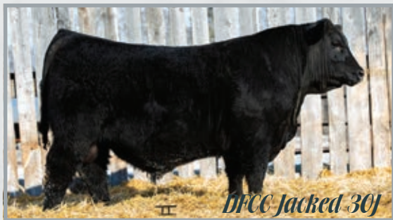
DFCC Jacked 30J