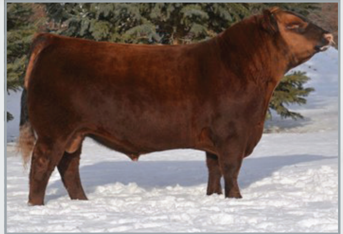
RED DAMAR TRUMP C512

REG NO. 2124383 TATTOO MRLA 42G DOB JANUARY 19, 2019 RED U2 RETROSPECT 29E X MRLA MISS 4408B