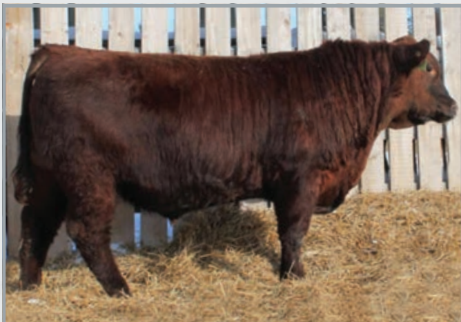
RED JAS JAMIT 39J REG NO. 2227899 TATTOO JASS 39J DOB JANUARY 30, 2021 RED MRLA RESPECT 42G X RED JAS PRINCESS 12A