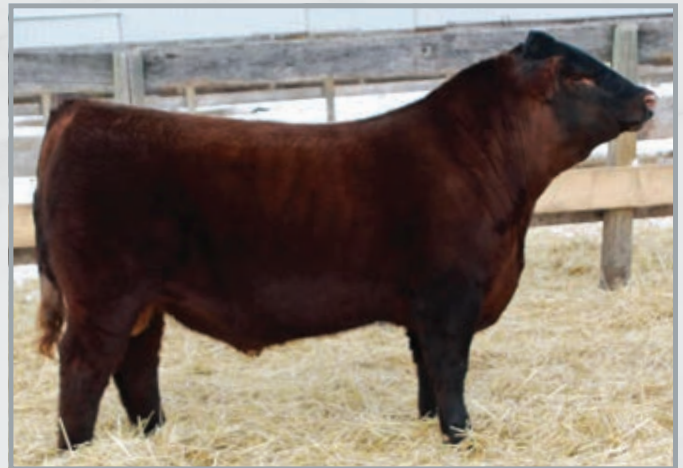
RED BCC BRYLOR OTM RESOLUTION

REG NO. 1572580 TATTOO SOO 161X DOB FEBRUARY 4, 2010 RED COCKBURN RIBEYE 308U X RED TR LYNN 301R