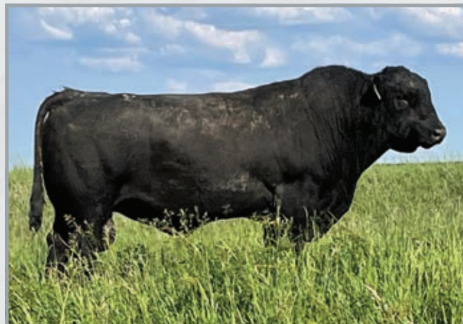
RRAR ROULETTE 5D REG NO. 1894373 TATTOO RRAR 5D DOB JANUARY 5, 2016 RRAR RISING STAR 12B X RRAR BLACKWILLOW 12A