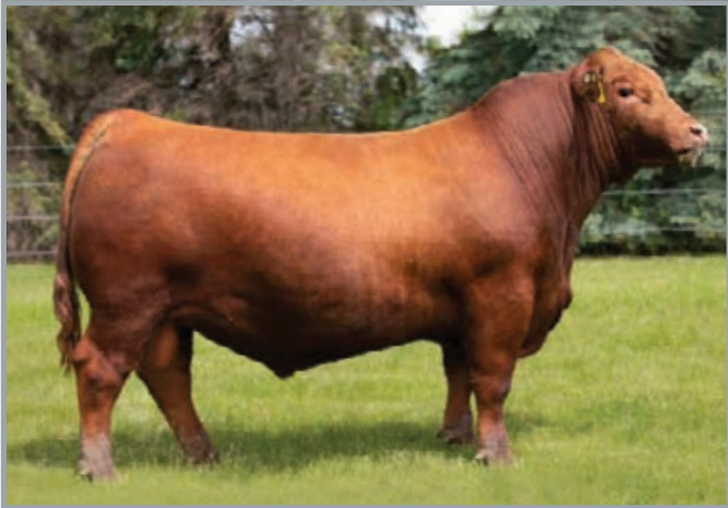
RED MRLA RESPECT 42G

REG NO. 2124383 TATTOO MRLA 42G DOB JANUARY 19, 2019 RED U2 RETROSPECT 29E X MRLA MISS 4408B