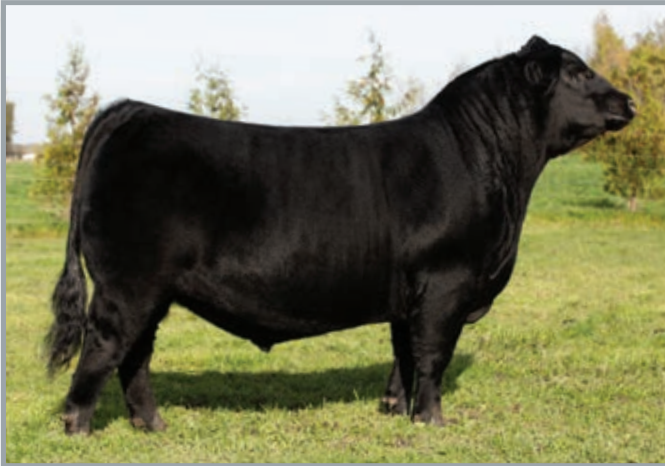
PREMIER RIP 29H

REG NO. 2151583 TATTOO PLS 29H DOB MARCH 2, 2020 PREMIER FUSION 809F X PFLC BARDETTA 38B