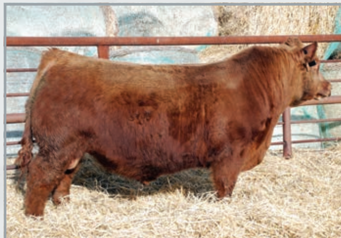
RED SSS TACTIC 651D REG NO. 1905596 TATTOO DBB 651D DOB FEBRUARY 1, 2016 RED SSS SOLDIER 252B X RED SSS DUCHESS 668A