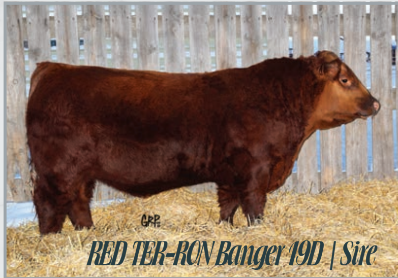
RED TER-RON Banger 19D | Sire