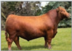
RED MRLA Respect 42G

One of the most complete heifers in the pen. AI'd to Red Damar Trump C512 on April 26, 2022.