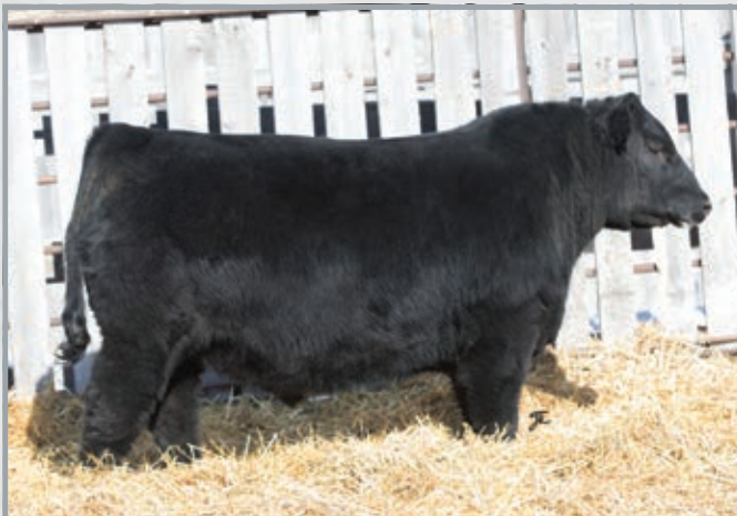
HLC C51 NATIONAL ANTHEM

REG NO. 2162467 TATTOO CHD 705H DOB JANUARY 27, 2020 HLC GRIT 310F X HLC CASSIE 391F