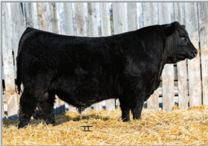
DFCC JACKED 30J

REG NO. 2067292 TATTOO TMF 21F DOB MARCH 1, 2018 YOUNG DALE RADIUS 16B X YOUNG DALE POLLYANNA 78S