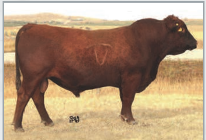
RED VGW NEXT STEP 554

REG NO. 2132556 TATTOO DRAW 39G DOB JANUARY 31, 2019 RED LWNBRG REVOLVE 166E X RED WARD'S JW REVOLUTION 39G