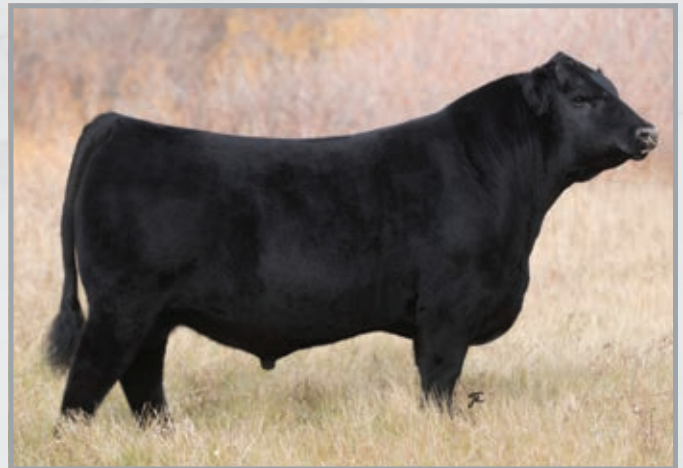
HLC GRIT 705H

REG NO. 2246848 TATTOO DFCC 30J DOB JANUARY 26, 2021 SCHIEFELBEIN ATTRACTIVE 4565 X DAM MERIT FLORA 6078D