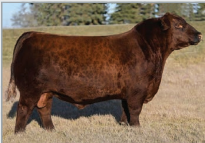
RED KJHT POWER TAKE OFF REG NO. 1954701 TATTOO IMP 6717D DOB FEBRUARY 4, 2016 RED S00 LINE POWER EYE 161X X RED SRA PAINTBUCKET