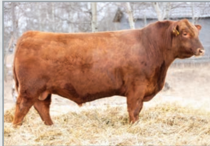
RED BRYLOR RESOURCE 66H REG NO. 2166640 TATTOO LMP 66H DOB MAY 1, 2020 MRLA RESOURCE 23F X RED BRYLOR OTHC REBA 49D