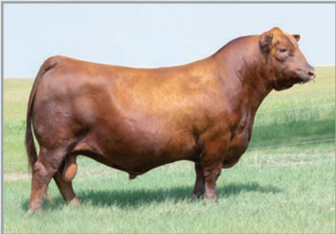
RED LSF SRR HEDGE FUND 7015E REG NO. 2084345 TATTOO IMP 7017E DOB JANUARY 6, 2017 RED H2R PROFITBUILDER B403 X RED LSF SRR DINA C5128