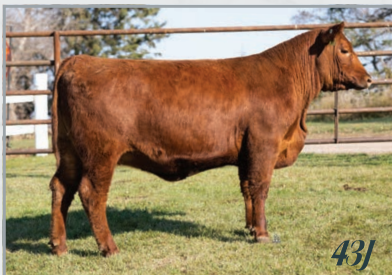
RED LSF SRR HEDGE FUND 7017E

Have used Hedgefund with great success. She will catch your eye. Pasture exposed to DRAW 396 from from May 20, 2022 - August 1, 2022.