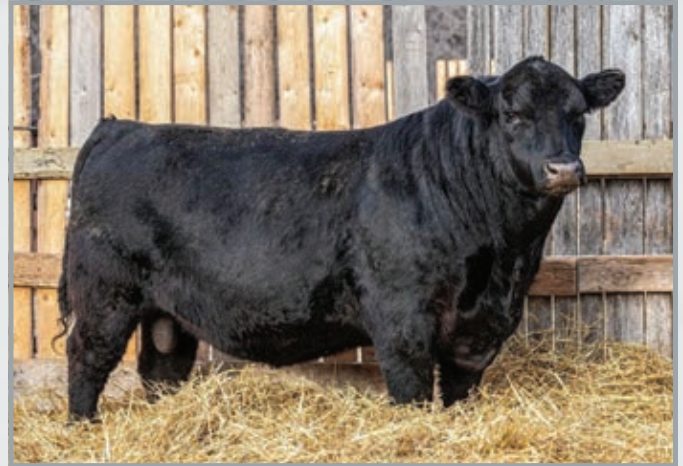
MADSEN FIVE IRON 21F

REG NO. 2151583 TATTOO PLS 29H DOB MARCH 2, 2020 PREMIER FUSION 809F X PFLC BARDETTA 38B