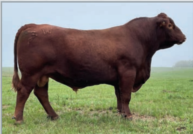
RED WARD'S JW REVOLUTION 39G

REG NO. 2170170 TATTOO BCCW 4H DOB JANUARY 1, 2020 RED BCC GATOR 18E X DAM RED BCC RENEE 44F