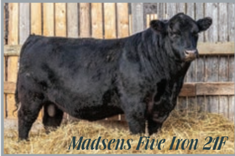
Madsens Five Iron 21F

Exposed May 15, 2022 to DFCC Jacked 30J Vet called 4-5 months September 7, 2022.