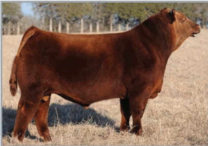
RED SOO LINE POWER EYE 161X

REG NO. 1954694 TATTOO IMP 0512C DOB FEBRUARY 1, 2015 RED SOO LINE POWER EYE 161X X RED DAMAR OH BABY W168